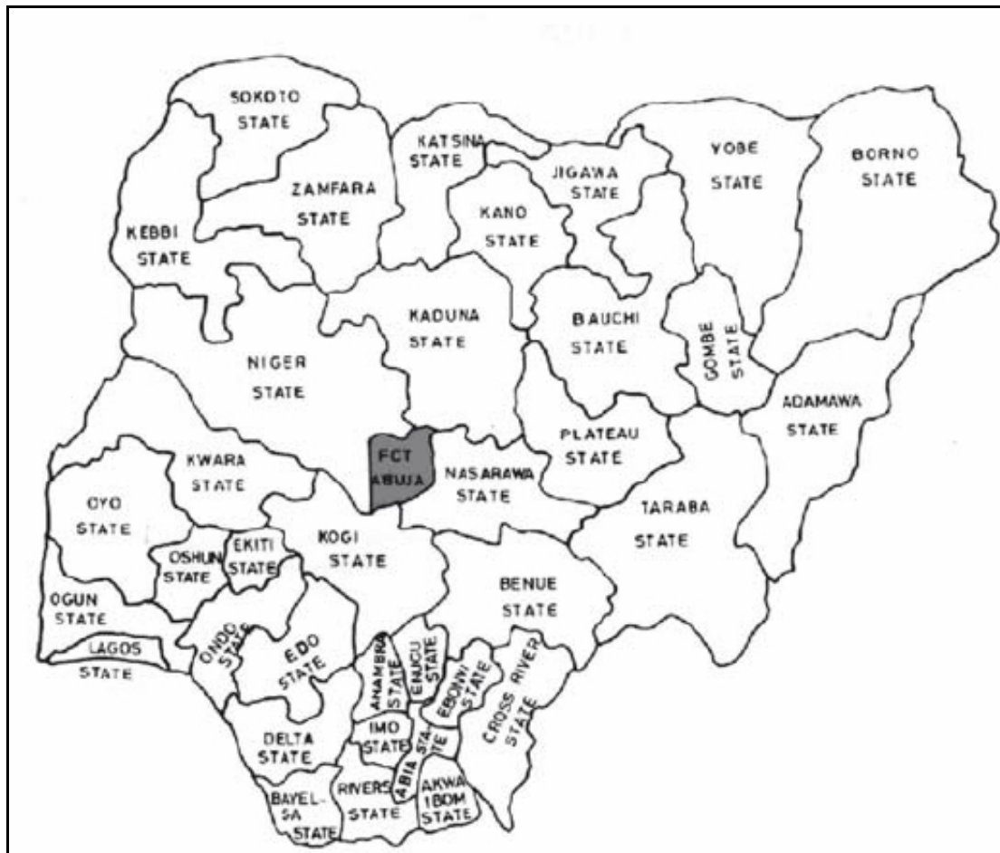
Figure 1. Map of Nigeria indicating the 36 States and FCT

On internal displacement crisis in the country, there are complex causes, phases and types. First, Nigeria is prone to frequent flooding particularly in lowlands and river basins where vulnerable communities live in unplanned informal settlements. Displacement is caused not only by the rains and overflowing water courses, but also by the mismanaged release of water from dam reservoirs, both in Nigeria and countries upstream such as Cameroon. The country suffered its most devastating floods between July and October 2012, displacing millions of people on the vast plains of the Benue and Niger rivers and their tributaries across 33 out of the 36 states in the country (IDMC, 2014). In 2013, floods displaced 117,000 people from many of the same areas, with Bauchi, Kogi and Zamfara states worst affected (IFRC, 2013; OCHA, 2013 in IDMC 2014). Flooding caused by heavy rainfall in Anambra, Cross Rivers, Delta and Oyo states in June 2014 caused at least 20 deaths and loss of public infrastructure and more than 100 homes (Floodlist, June 2014; July 2014 in IDMC 2014).